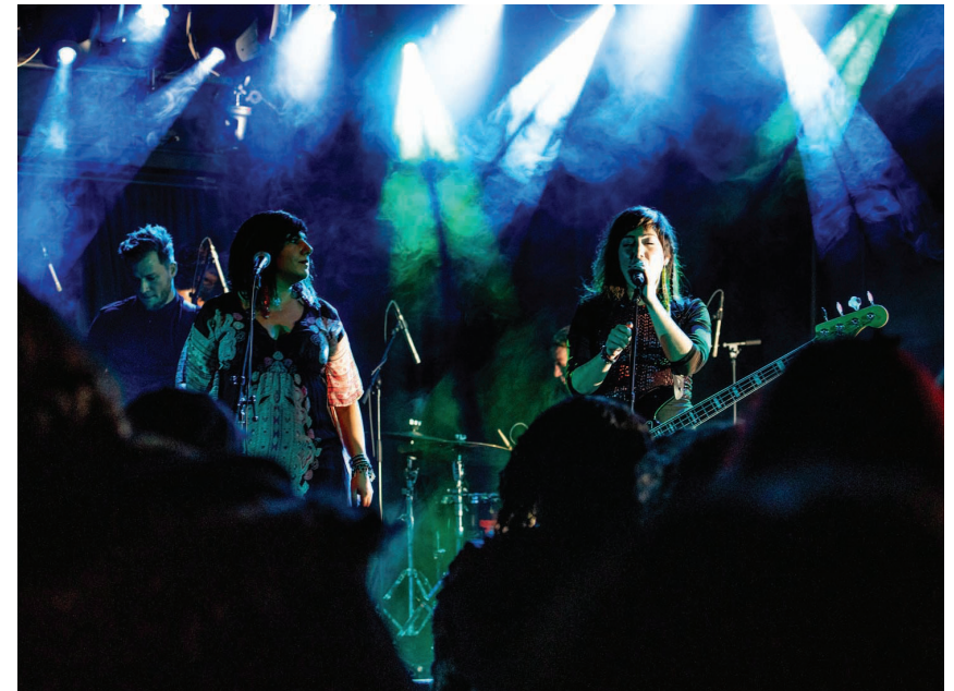
Artists: ABJEEZ

In Iran, the legal code is based on both Islamic and civil law. Under these laws, it is illegal for a woman to sing in front of mixed-gender audiences. As such, many female Iranian musicians have been forced into exile simply because they pursued careers in music. In Russia, an amendment to existing child protection laws criminalizes what is referred to as “gay propaganda.” Under this amendment, artists who make work that openly explores issues of sexual orientation and gender identity are at risk of arrest and imprisonment by the government. One artist from Russia who identifies