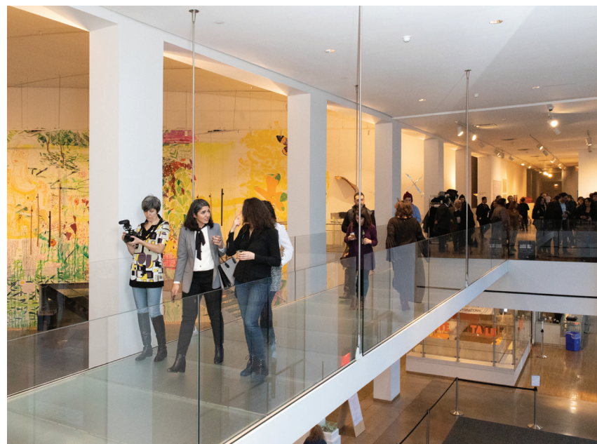
Artistic Freedom Initiative exhibition at Queens Museum, titled Executive (Dis)Order: Art, Displacement & the Ban .

Lastly, when coordinating relocation of an at-risk artist, it is important to consider not only the political climate of the individual's home country, but that of the hosting site's country as well. For example, over the last several years, the political climate in the United States has become increasingly anti-immigrant, and nationalist movements around the world continue to gain momentum. In the United States, an artist can face increased difficulty securing visa or petition approval, and obstacles when attempting to expedite their entry into the United States. When evaluating available options for relocation in each artist's case, these factors must be considered and addressed accordingly.